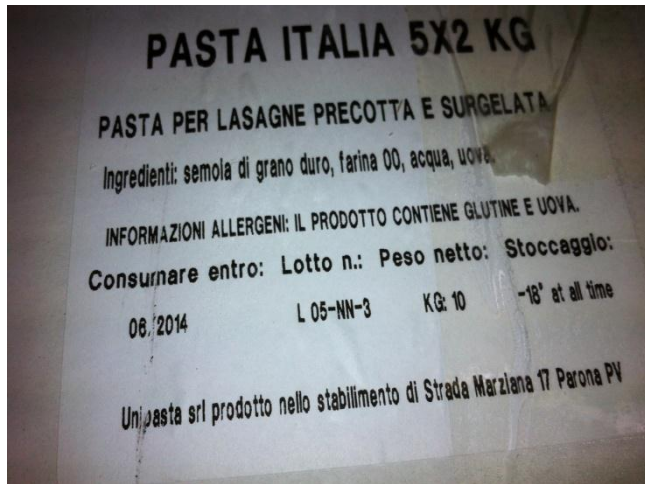
Pasta sfoglia per lasagna