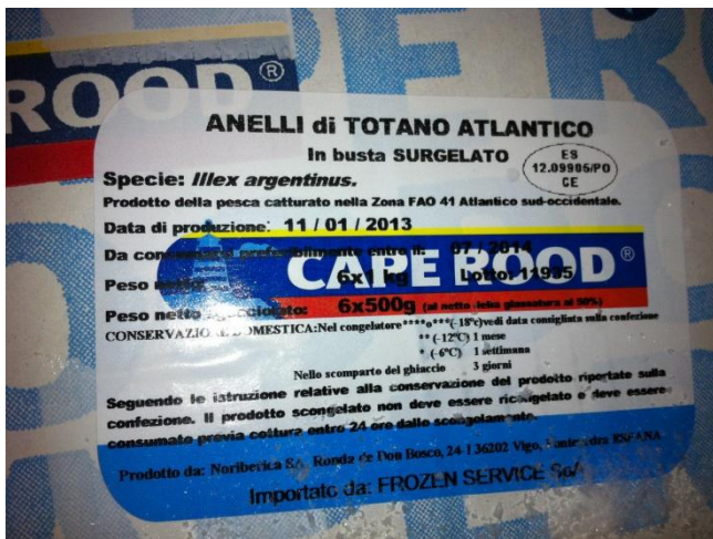
Totani area Fao 41 Atlantico