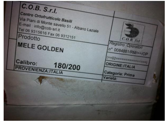
Frutta e verdura del 18 feb 2013